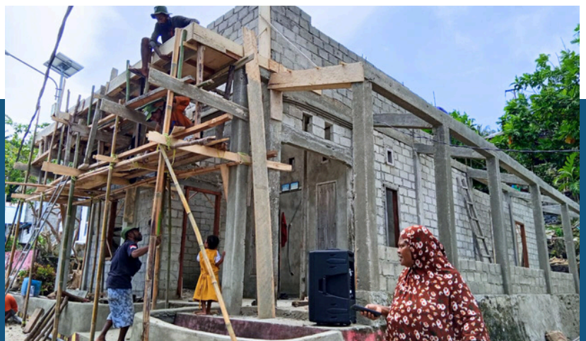
Watkidat people building their own Production House, using their own Village Fund, in support to GEF6 Facilitation.

A field visit was carried out in early June 2024. Based on the results of discussions with relevant stakeholders, significant changes were found in the community's understanding and behavior towards the GEF6 objectives. Not only in the increased income for Women and Fishermens, but the develop of better mindset for every stakeholders.