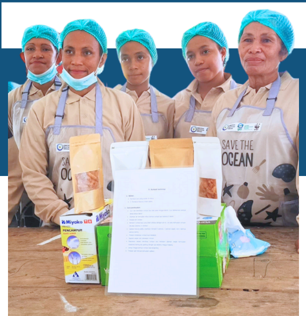
Fisherwomens Processing Group